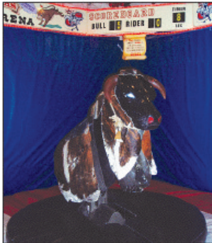
"Ride the bull" at Big Bubba's Bad BBQ.

For more information on Big Bubba's Bad BBQ, contact Roger Sharp at (805) 238-6272, or go to their website: www.BigBubbabadBBQ.com .