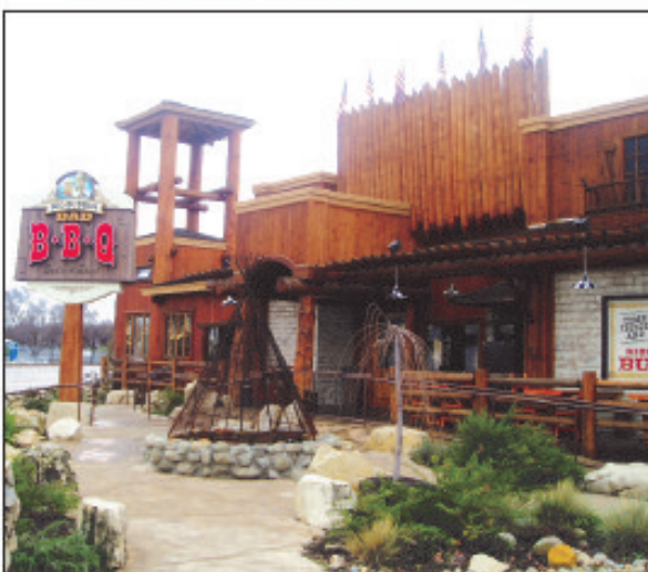
Left – The western fort-like facade of Big Bubba's in Paso Robles sets the stage for fun, family-friendly dining.